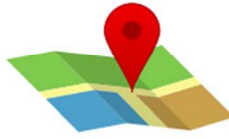
Proof of Address