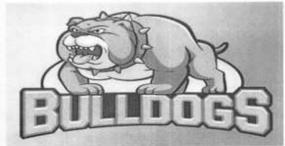
7th Grade Berrendo Boys Basketball Schedule